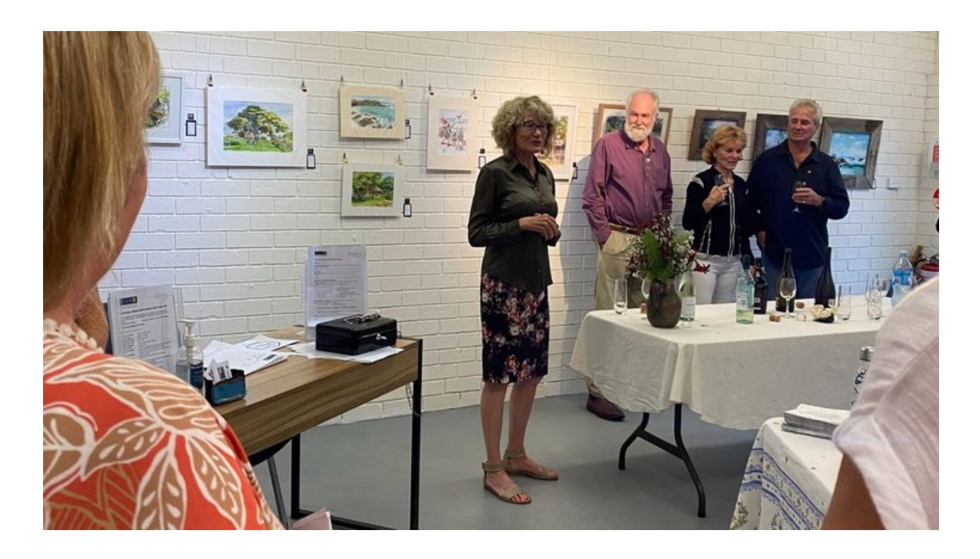
Opening of Postcards from Narooma, at Narooma Gallery

During summer, we hosted two exhibitions at the Narooma Gallery and the timing was perfect to catch the crowds.