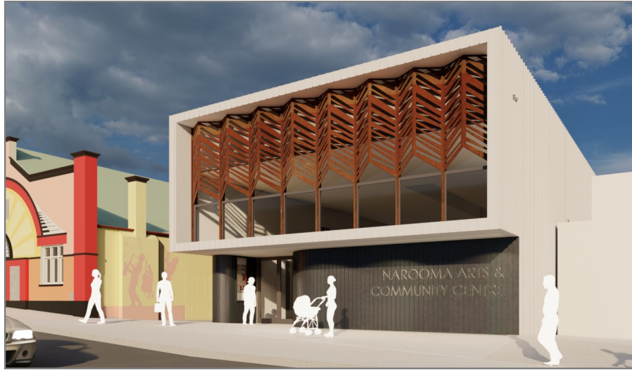
Narooma Arts & Community Centre will be built alongside the heritage-listed School of Arts Memorial Hall creating an inspiring cultural and community hub

"The NACC with its three multi-use studios/rooms and gallery will be the heart of our community for everyone to use, young