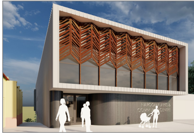
The stunning front of the NACC on the Princes Highway. By CK Architecture

It will be some months though before anything much will happen on site but, rest assured, much will be happening behind the scenes. We will keep you posted.