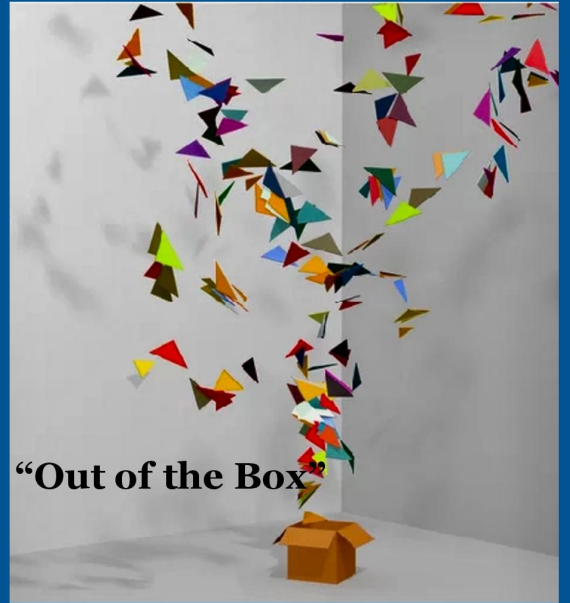
"Out of the Box"

Creating on & with Paper Collage, Decoupage, papier-mâché & much more