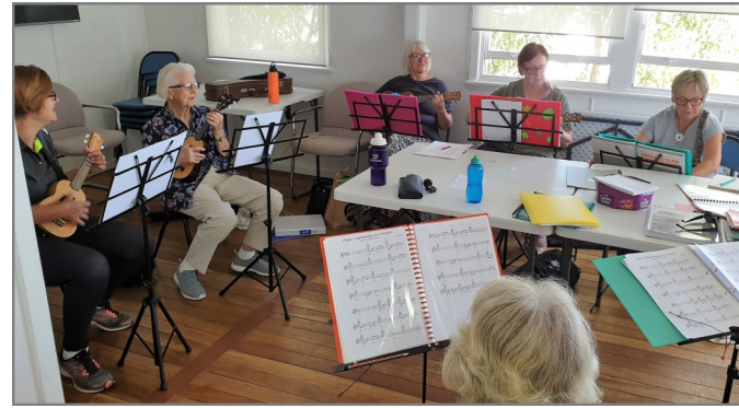
The Studios on Monday afternoons are now home to ukulele groups.

Gallery exhibitions continued from previous page she will put on another exhibition 2021/2022.