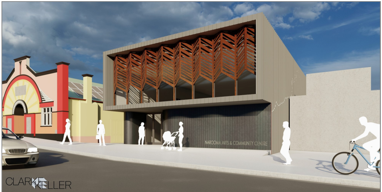
The redesigned front facade of the proposed Arts & Community Centre on community-owned land.

Our architects from ClarkeKeller recently presented their plans of the redesign of the Arts & Community Centre, particularly the front façade, as requested by the School of Arts committee in response to feedback from the community.