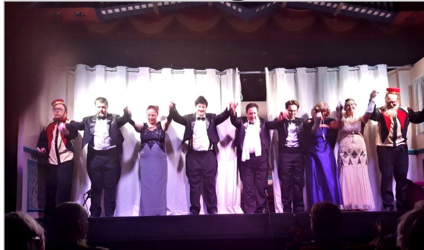
Moruya's Red Door Theatre Company returned to the Kinema stage on Sunday 24 November with 'A Comedy of Tenors'. A great success.

Narooma Historical Society's photographic exhibition in SoART Gallery of 'Old