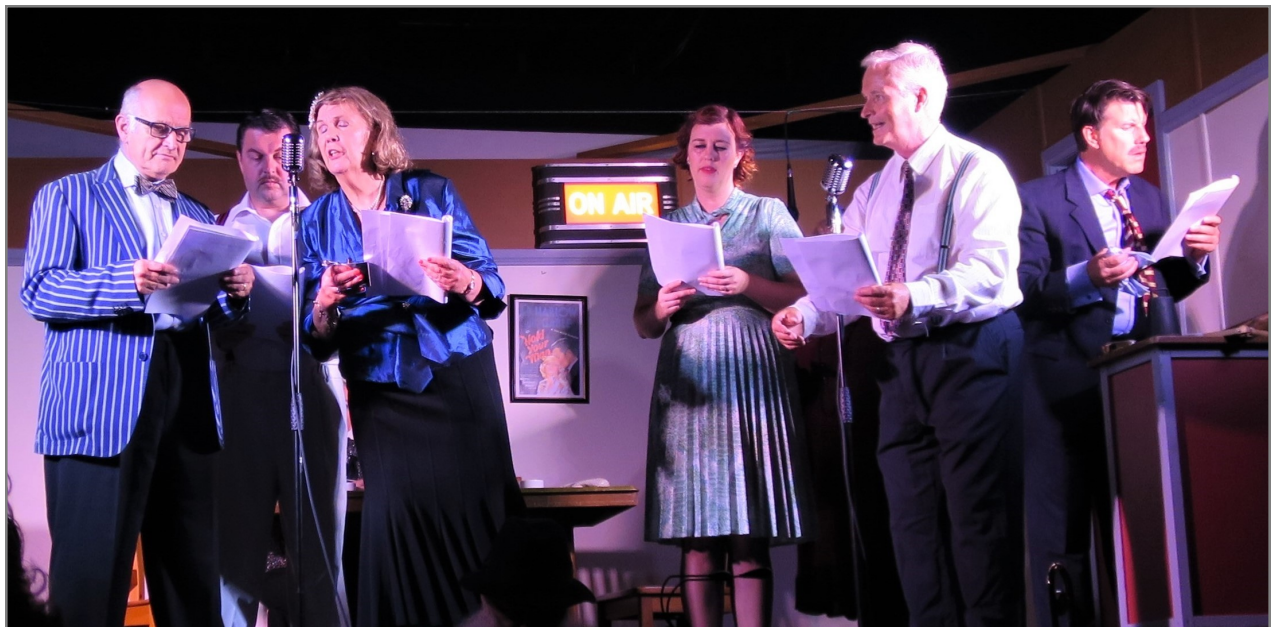
On stage at the Kinema, some of the Moruya-based Red Door Theatre Company cast in the 'Magical Moments Radio Show' based on the early days of radio at 2GB and their acting troupe the Macquarie Players.