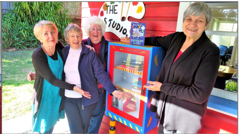
School of Arts' Studios Book Swap Nook is proving to be extremely popular

This has also prompted some thought as to whether someone might be interested in starting a book club in the Studios. Please ring Suzanne if you are interested (0431 486 617).