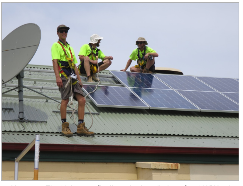
Narooma Electric's crew finalises the installation of a 10KW solar energy system at the Hall on Monday 22 February.

Narooma's culture and is greatly valued by people of all ages,' he said. 'Rotary is increasingly becoming involved in projects to future-proof communities.'