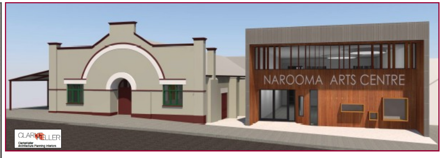
Artist's impression showing the Campbell Streetscape with upgraded Hall on left and the proposed Narooma Arts Centre on the right.